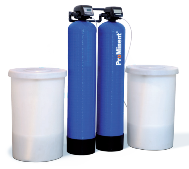
Types of equipment